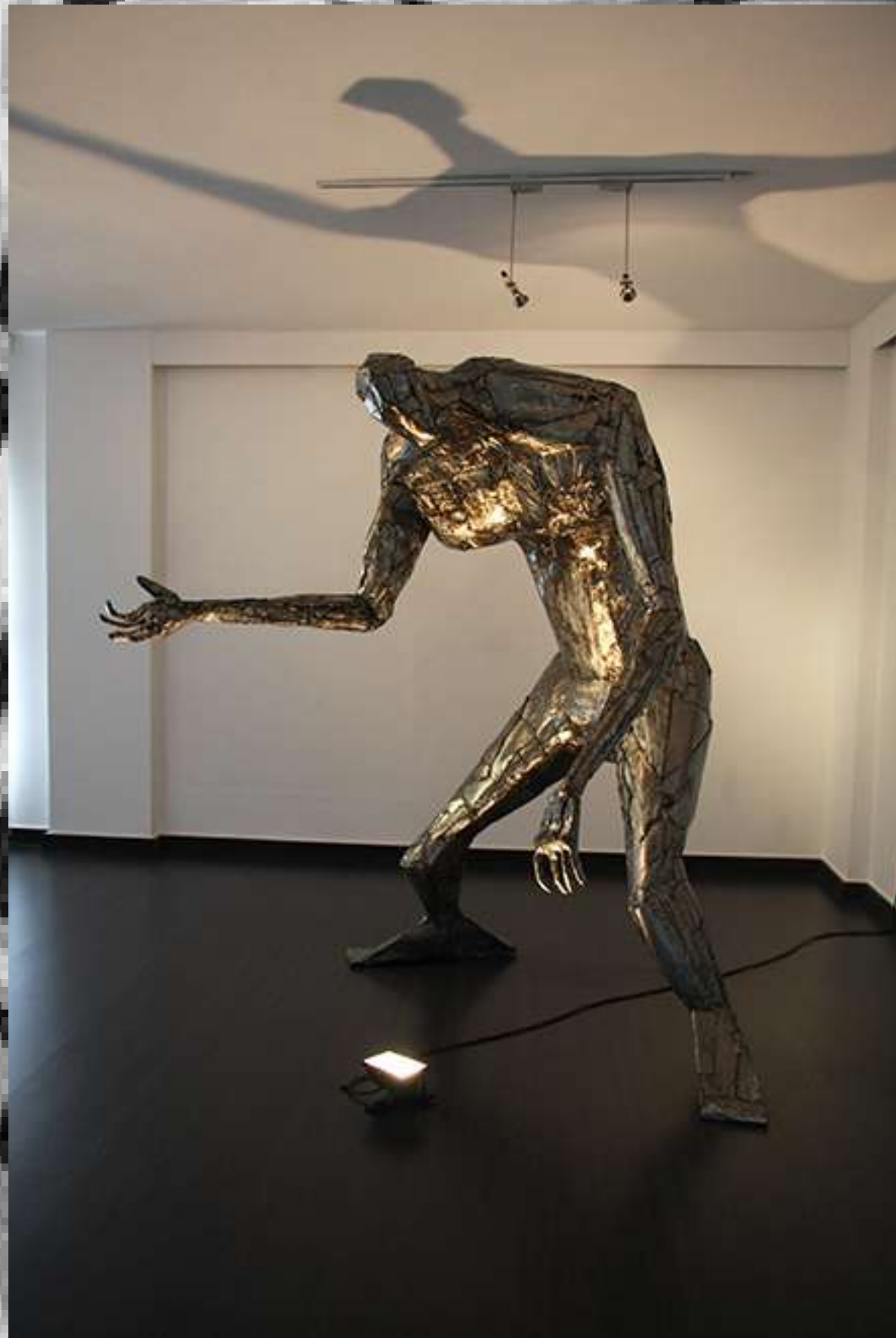
The Invisible Giant Artist: Jalal Luqman Galvanized Steel 248 x 155 x 200 cm