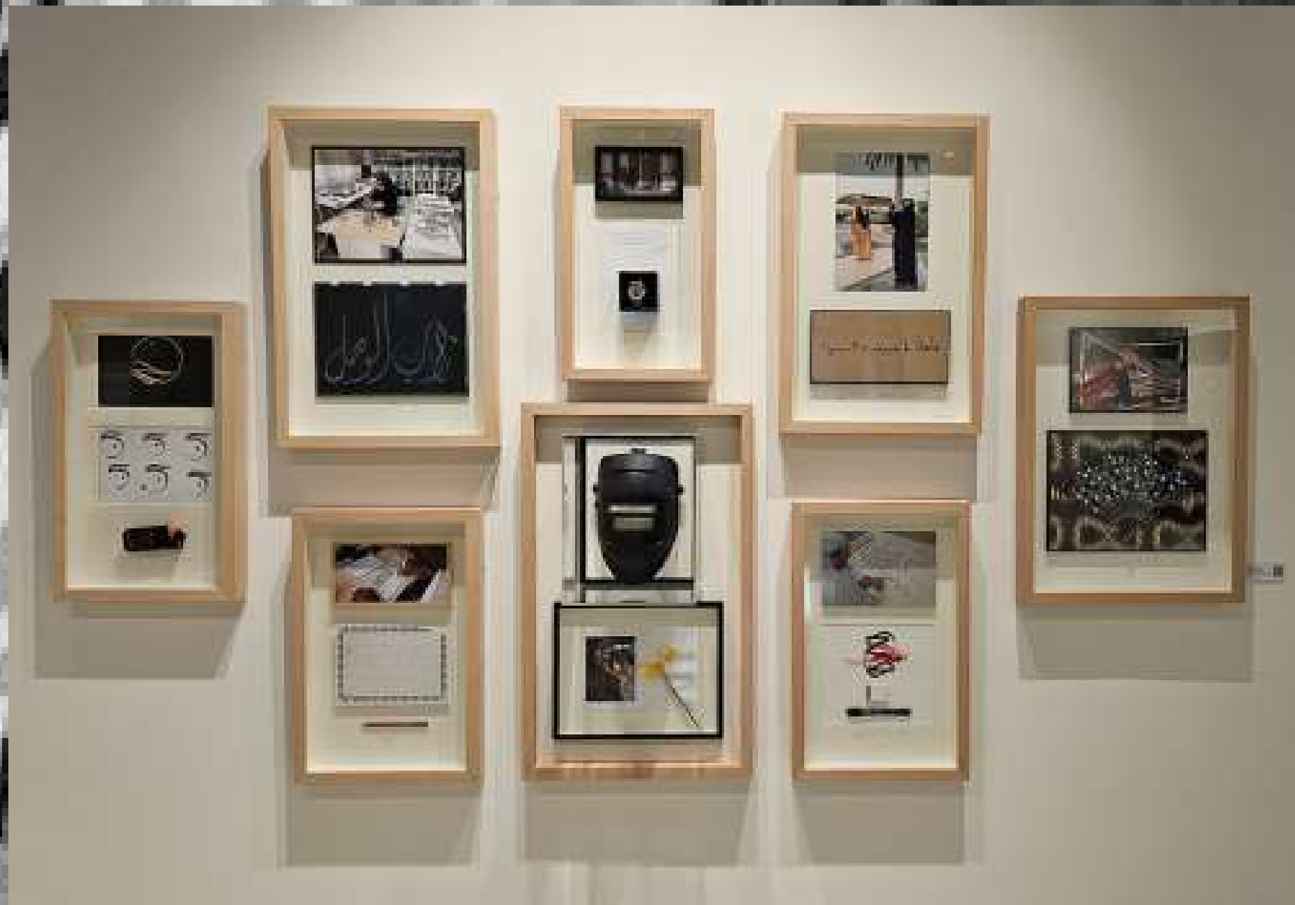
Artists Tools Artist: Khalil Abdulwahid Dimensions: Variable Material: Mixed media installation